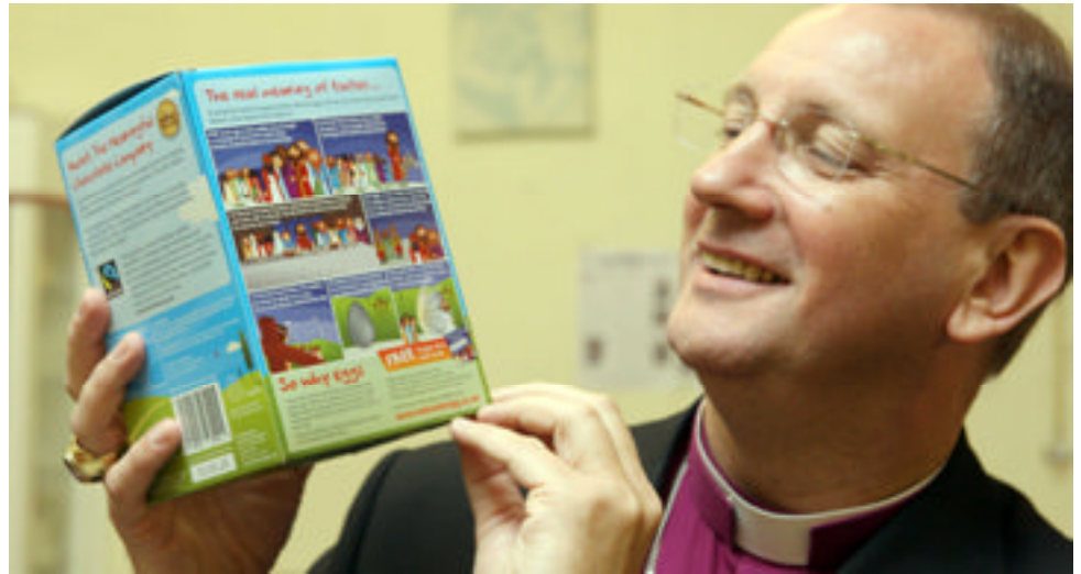
Bishop Mark captured by the moment!

There are many ways to take part and you can find all the information and register on www.Allthebells.com