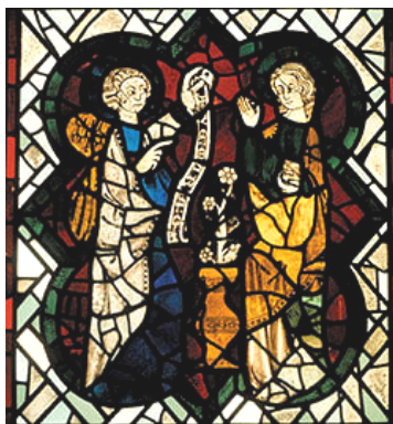
Annunciation Window, York Minster

Tuesday 04—Thursday 06 November 2008 St Edmund's College, Cambridge Cost £180, application deadline 07 October. Contact 01223 741281, www.faraday-institute.org