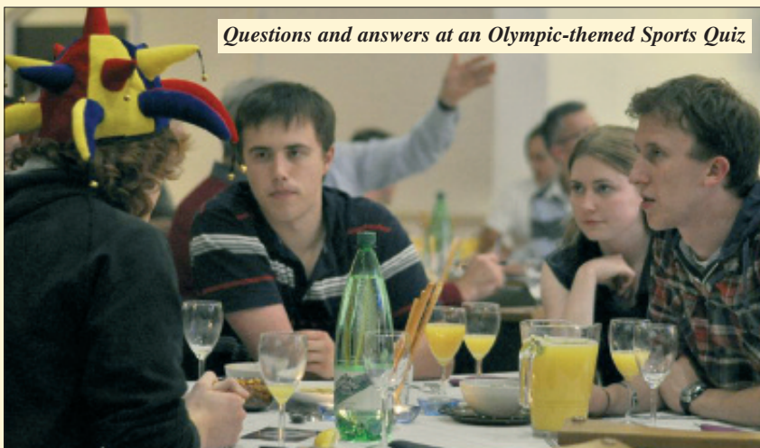
Questions and answers at an Olympic-themed Sports Quiz