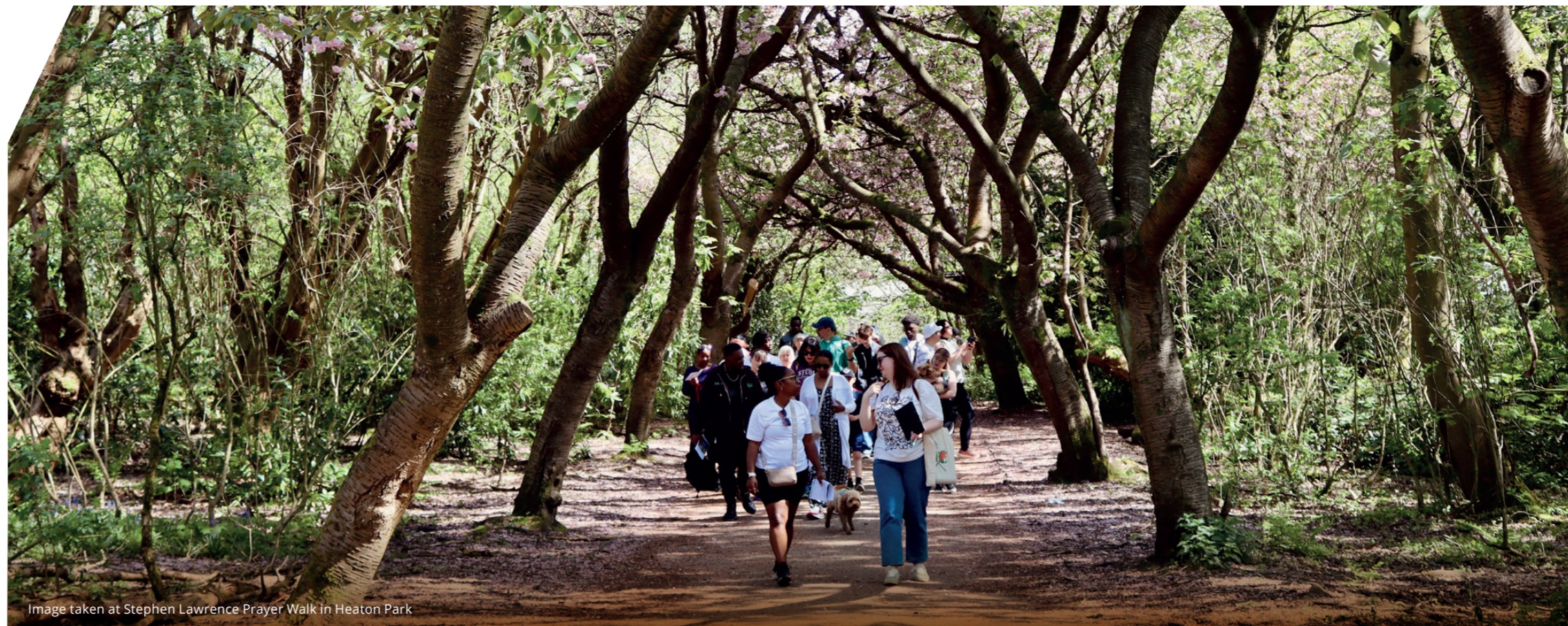
Image taken at Stephen Lawrence Prayer Walk in Heaton Park